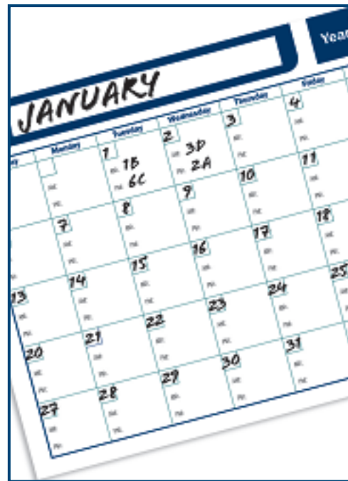
Figure 1: Your daily injection entry should look like this.

The inside flap of the planner has a picture of the human body showing each injection site listed by number. Since there are several possible injection areas within each numbered site, four lettered areas make it easy for you to write down the location of your last injection. Each day of the month has a space for writing down your morning and evening injections. Once you have given yourself an injection, write down the number of the injection site and the letter of the area you used. For example, you would write 2A to show that the shot was given in the upper right arm, upper left area. At the end of each day, you should have two different injection sites and areas written down. Using your planner will help you remember to change injection sites and areas and to take both doses each day as prescribed.